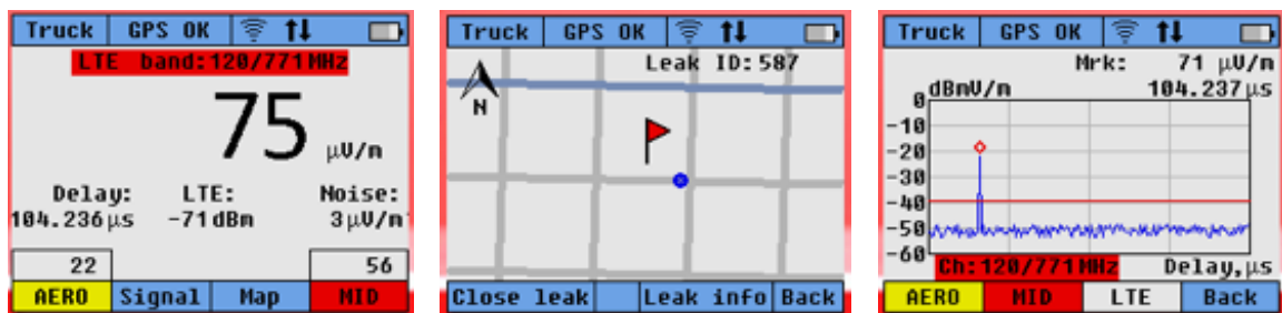
FIGURE 2 CORRELATOR RESPONSE, DETECTED VIEW AND MAP VIEW

The system has been realized in three main components: A QAM Snare™ headend signal processor, a server, and several varieties of field units used to detect the leak and troubleshoot the exact deficient network component. Field units used for driveout or mobile detection are installed in service vehicles to continuously monitor for QAM leakage on up to three channels simultaneously. Every second, data packets from the headend are received and compared with signals pulled off the vehicle local antenna to determine if QAM leakage is present. Whenever locations with leakage are detected the data is processed and the exact GPS coordinates of the leak and the actual 10 ft. source magnitude is calculated, all in real time. A flag identifying the location is then displayed on the field unit so that it can be immediately repaired, if desired. Complete leak data summary statistics, vehicle drive routes, measured LTE downlink signal strength (for prioritization of repair), current status of previously detected leaks and work orders – as well as a myriad of other details – are maintained in an openly exportable database. The software screenshots in figure 2 below show the output of the cross correlation process as well as a map view showing the vehicle route and the flagged leak location.